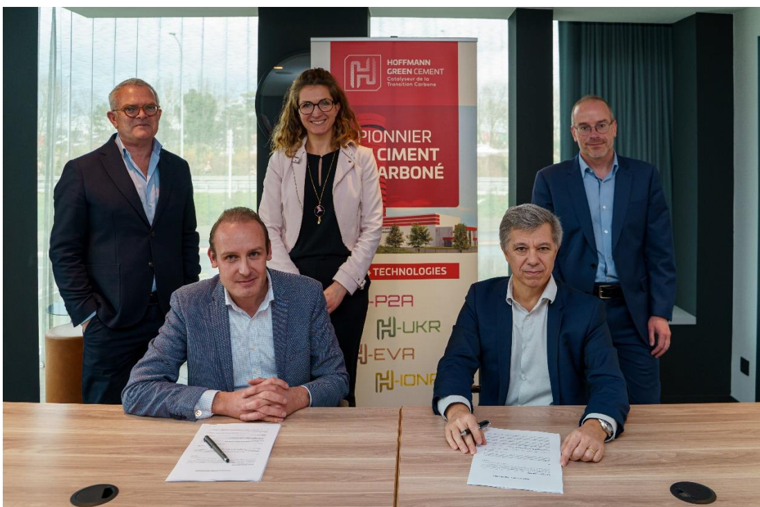
The management teams of Hoffmann Green Cement and the Alkern Group

In particular, the Alkern Group will produce pavers, curbs and street furniture with Hoffmann cements.