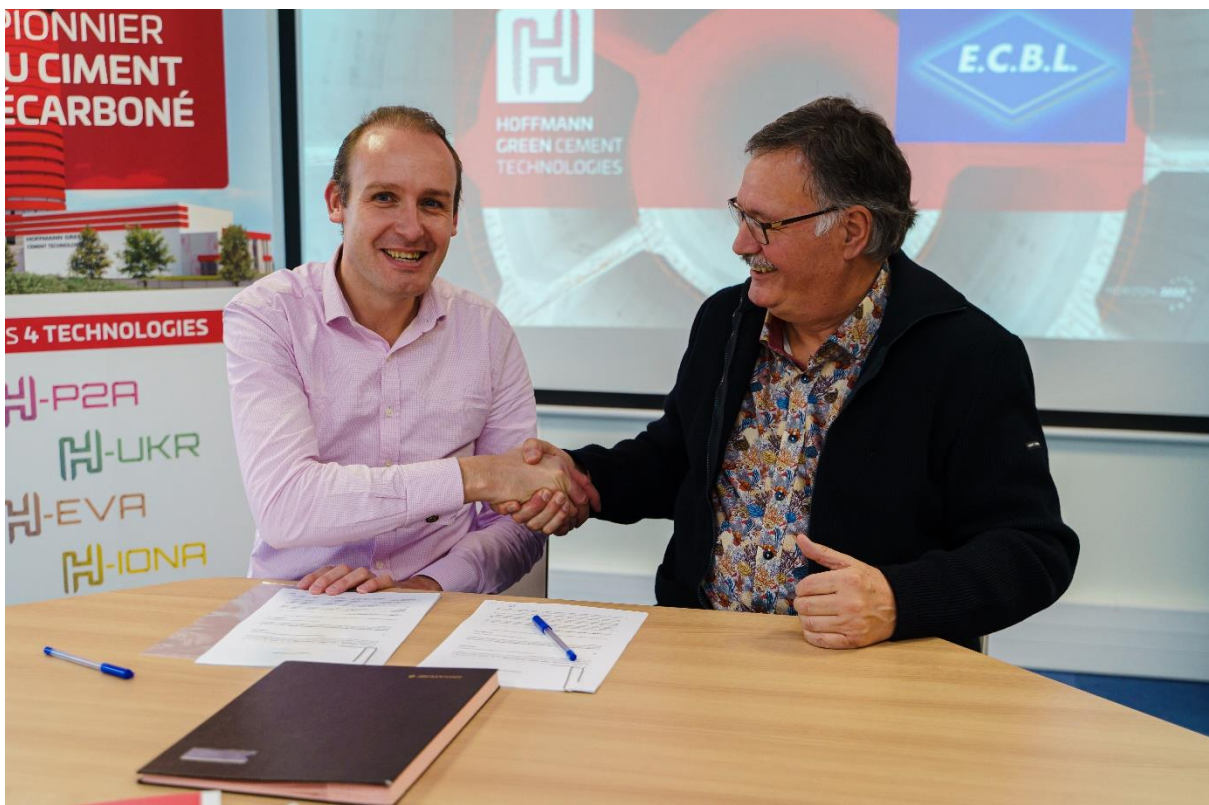
The Hoffmann Green and E.C.B.L. management teams

Hoffmann Green will supply E.C.B.L with its clinker-free decarbonized cement over the next three years for structural work such as the construction of multi-unit housing and industrial, public, tertiary and office buildings, as well as major heritage restoration work. This is the first contract with volume commitments signed by Hoffmann Green with a general construction company whose head offices are located in the vicinity of Hoffmann’s. This partnership illustrates the dynamism and innovation that exist locally in favor of decarbonizing the construction sector.