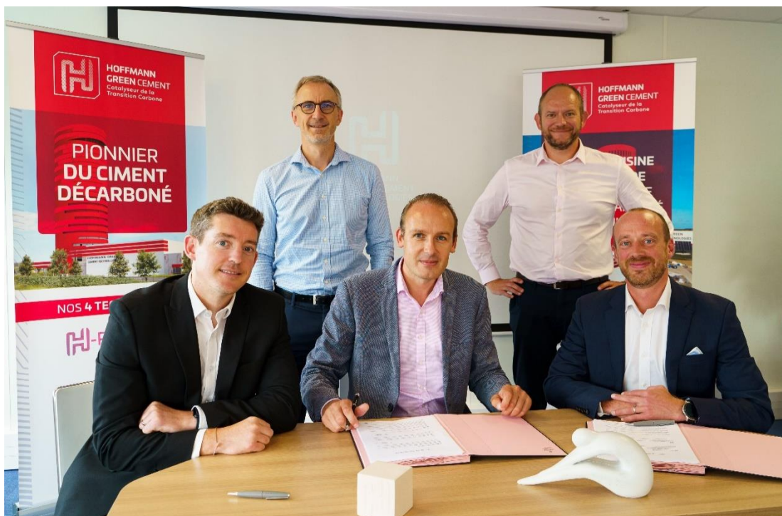
Hoffmann Green and Cemblend management teams

From the second half of 2022, Hoffmann Green will supply Cemblend with its H-IONA, H-UKR and H-EVA clinker-free decarbonated cements for distribution to its customers in the UK and Ireland. This exclusive distribution agreement with volume commitments initially runs until the end of 2023 and is a first step towards the signature of a licensing agreement which could see Cemblend build and operate a production unit similar to Hoffmann Green's second production site (H2), and then produce and market Hoffmann cements in the UK.